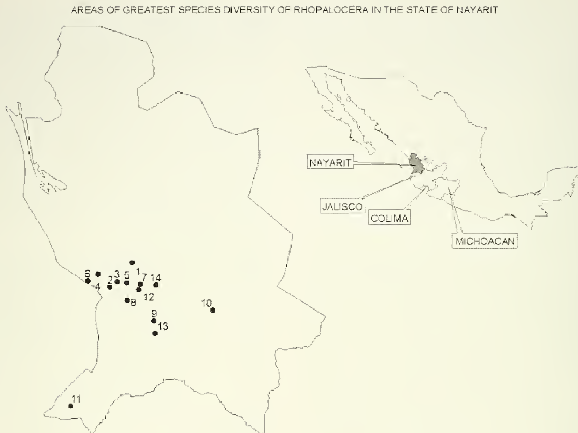
FIG. 1. Map of Nayarit, showing its position in western Mexico, with respect to Jalisco, Colima and Michoacán). Numbered localities refer to localities listed in Table 1, the richest known sites in the state in numbers of butterfly species.

extend into Sinaloa to the north), and in part an artifact of where surveys were conducted in Nayarit. The largely inaccessible north-eastern third of Nayarit remains virtually unknown for butterflies, and its fauna would presumably show strong faunal influences from the Sierra Madre Occidental. Great potential remains for adding new species to the list presented herein from the north-eastern third of the state.